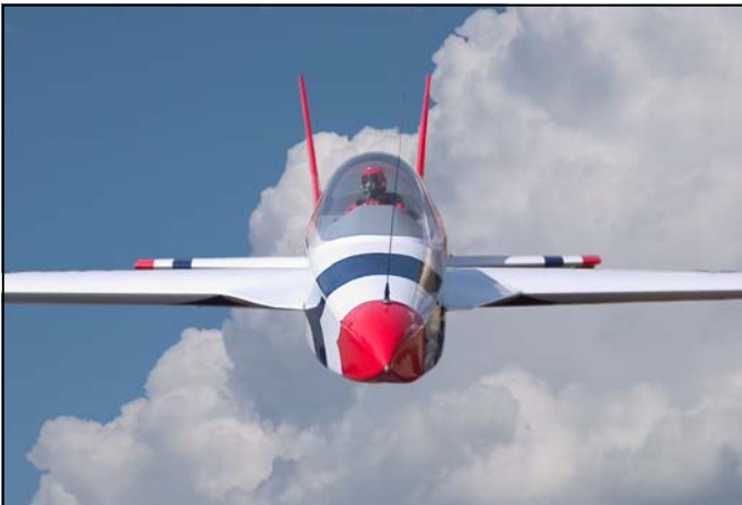
Using either a very tall ladder or the magic of digital, member Tom Auga created this picture featuring Gary Jones' turbine powered AcroJet. See page 4 and note that Tom was the lucky person at the August meeting.