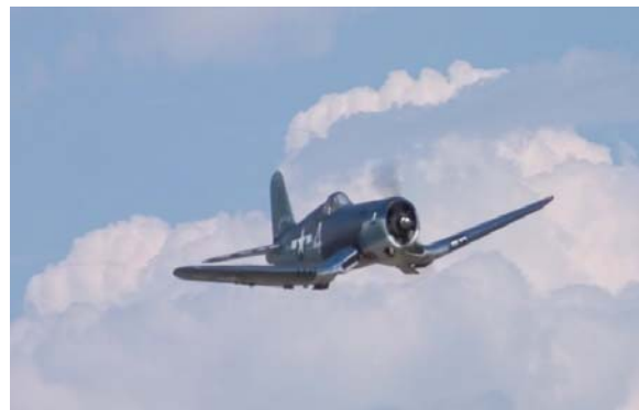
Is this a full scale Corsair or a scaled down model? In fact it was model flown by either Brian O'Meara or Egil Wigert. A tribute to both the builder and the photographer.