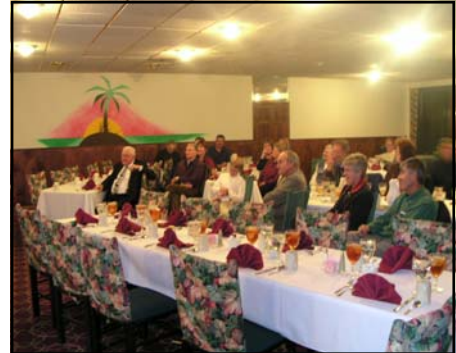
An oasis away from the storm. Despite a snow storm a respectable crowd gathered for the annual banquet. This year's banquet was held at the Oasis Restaurant in downtown Greeley.