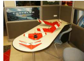
Sample of aircraft