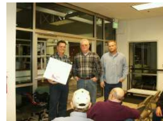
Lucky winner with Speedwing's owners