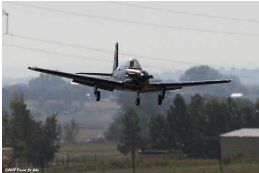
Scaled Pursuit Model from Warbirds 2008