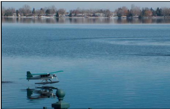
Gary Bauerle's Senior Kadet just after lifting off from glass like surface on Lake Loveland.