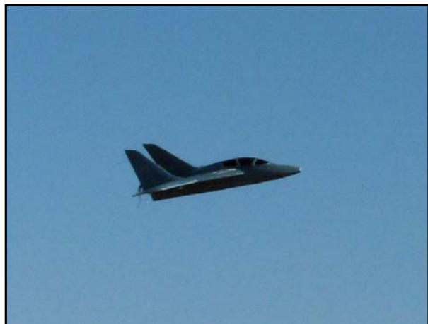
Bill's electric F-27 Stryker (?) has a nice presence in flight.