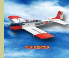
World Models T-34