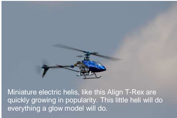
Miniature electric helis, like this Align T-Rex are quickly growing in popularity. This little heli will do everything a glow model will do.