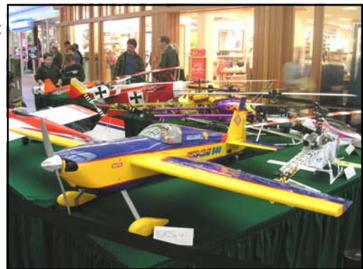
2004 Fort Collins Foothills Mall Show