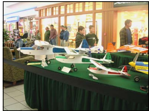
2004 Fort Collins Foothills Mall Show