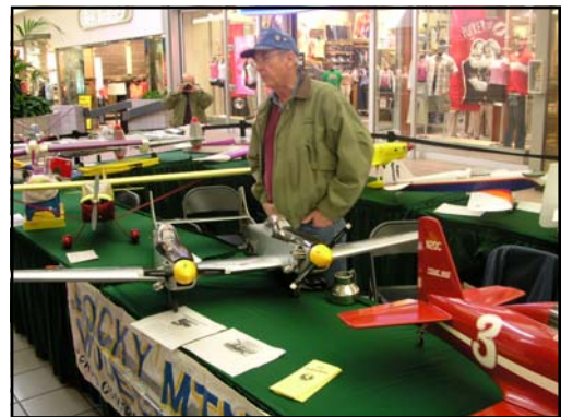
2004 Fort Collins Foothills Mall Show