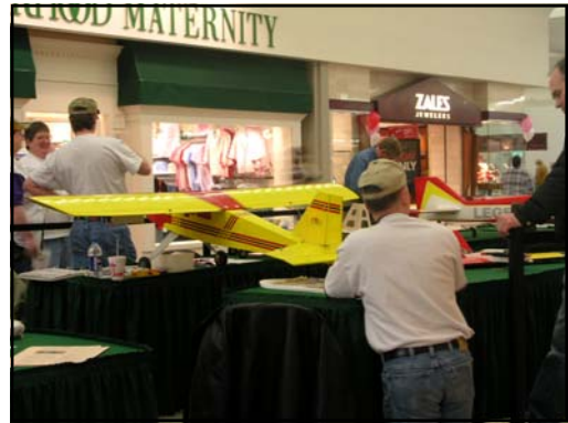
2004 Fort Collins Foothills Mall Show