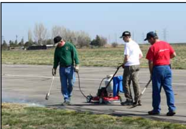
Bringing out the heavy FIRE power on clean up day.!