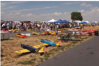
View of the north half of the pit area.