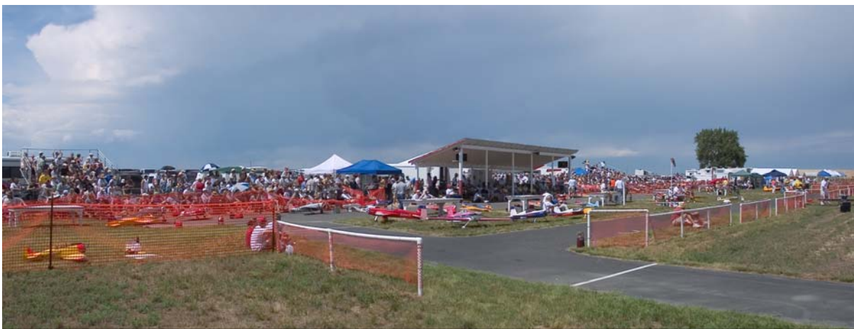
A panoramic view at midday of the 2004 Rocky Mountain Big Bird Festival.