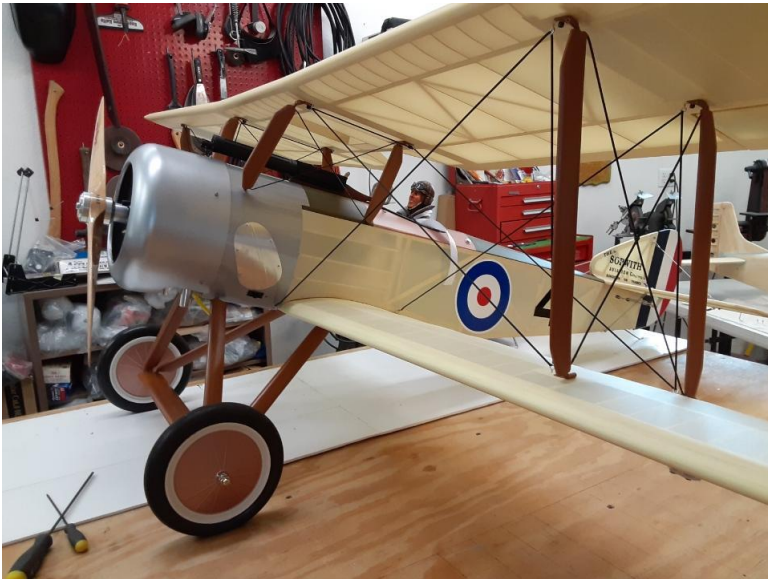
Figure 9 Covering, painting and graphics complete.