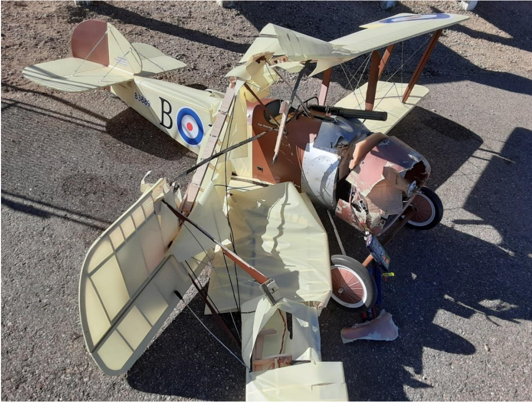
Figure 1 Dave Mosier's Sopwith Camel destroyed in a midair collision November 2020. War birds and 3D aerobatic planes do not mix.