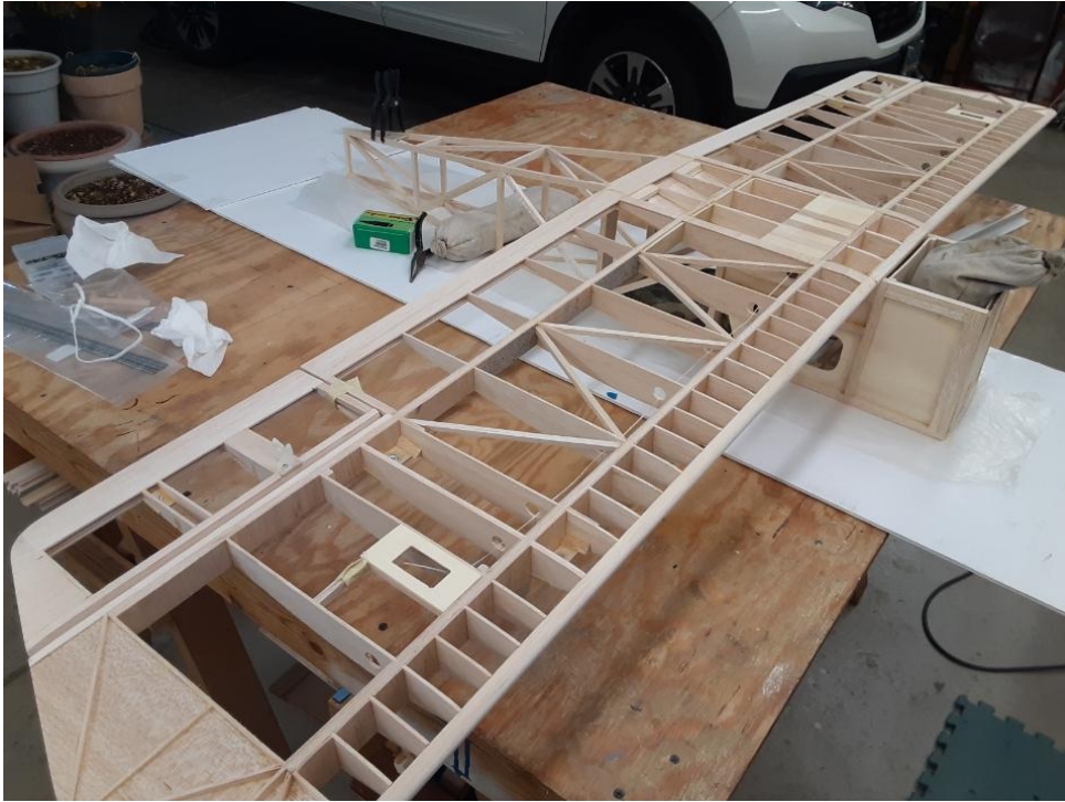
Figure 3 Bottom wing framing complete