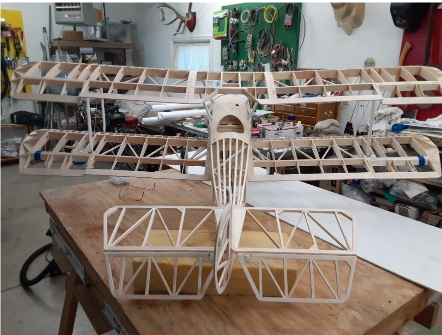
Figure 6 Framing complete