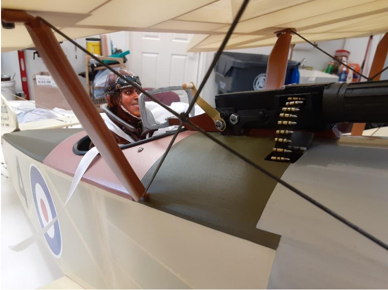
Figure 10 Aces of Iron pilot painted and 450 rounds of .303 British ammo in the magazine.