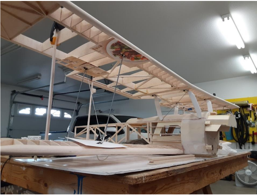
Figure 5 Framing the cabanes and wing struts.