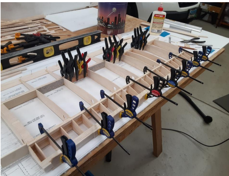
Figure 2 Framing the wings of a 1/4 scale Balsa USA Pup