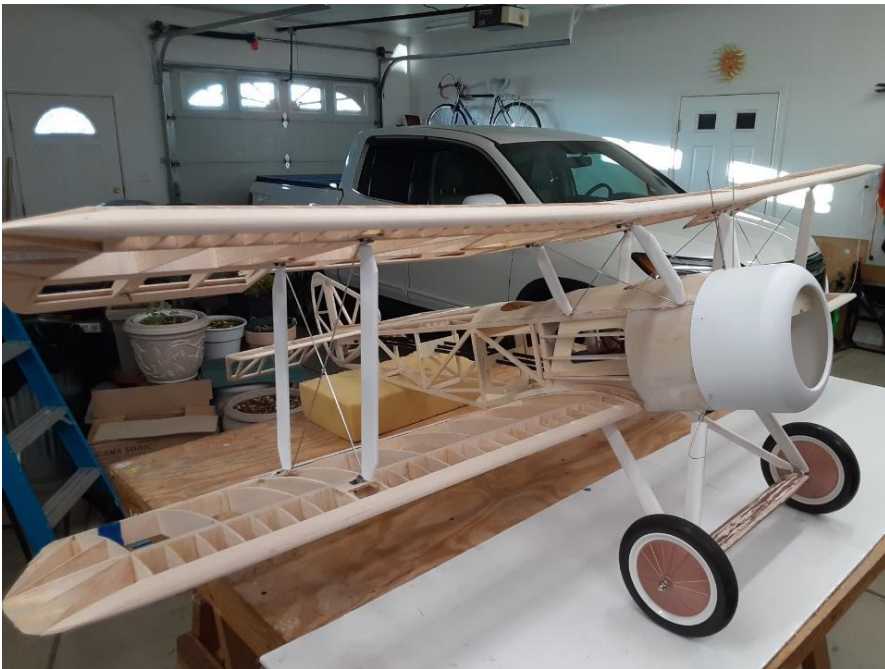
Figure 7 Cowl and engine installation.